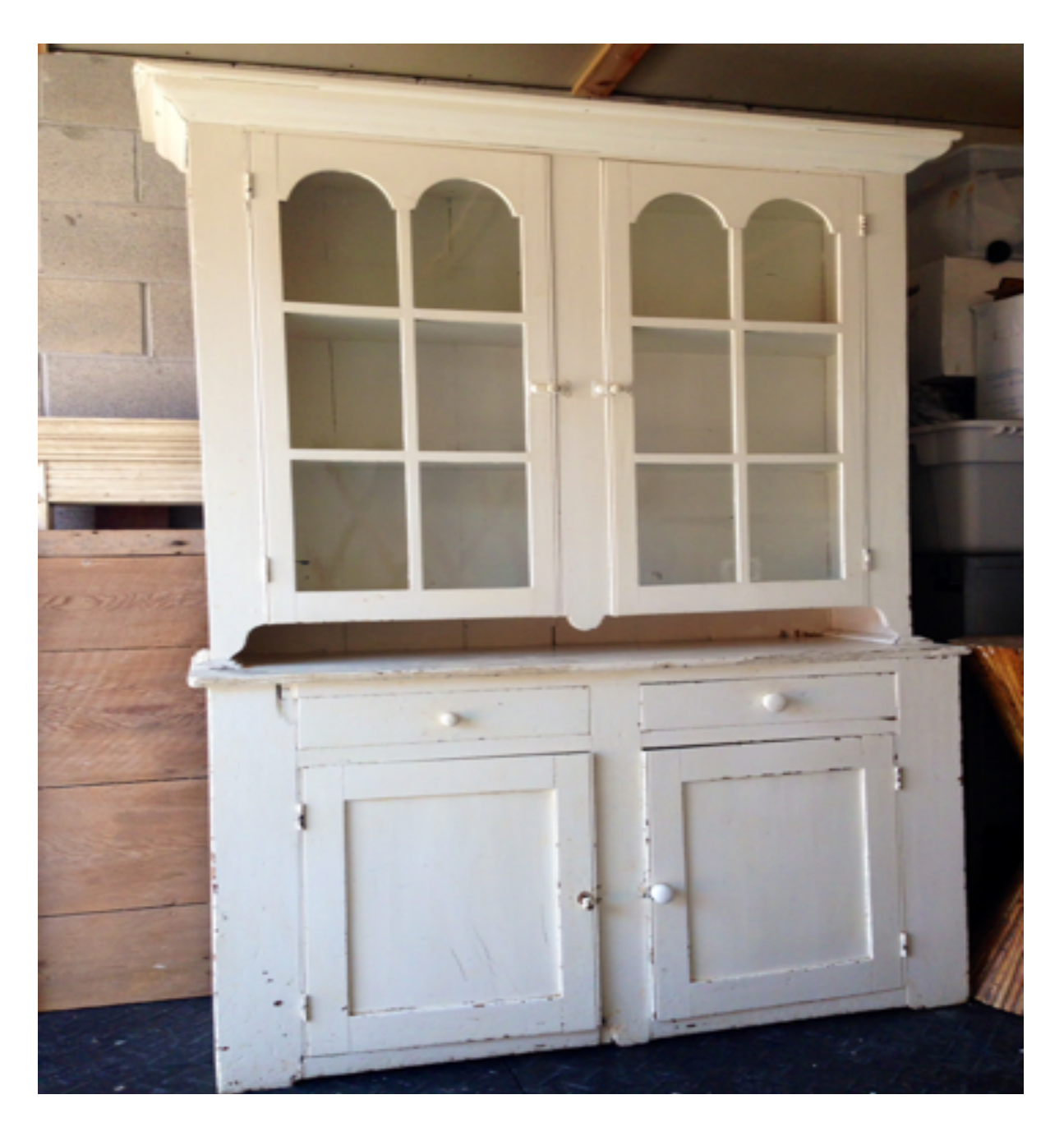
GOOD BYE MY PRETTY... STORED AWAY BUT NOT FORGOTTEN!!

I also took a few pics for a visual reference.